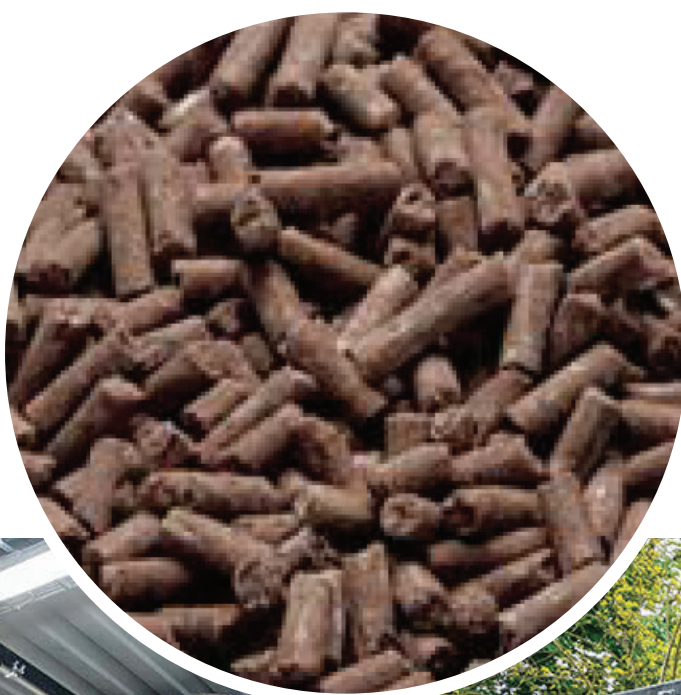
Pelletized compost product from a sealed composting system